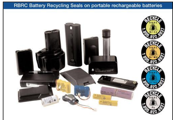
RBRC Battery Recycling Seals on portable rechargeable batteries

Liquid paint (LATEX ONLY) can be hardened or solidified and discarded in your regular trash. An effective way to dry out latex paint is to mix oil dry or clay catbox filler with the liquid paint (approx. 1:1 ratio) and allow it to dry out. Seal containers and place inside a plastic trash bag and set inside your trash container. Try to limit the number of cans you place out at one time. Please make sure that children and animals cannot get into the paint.